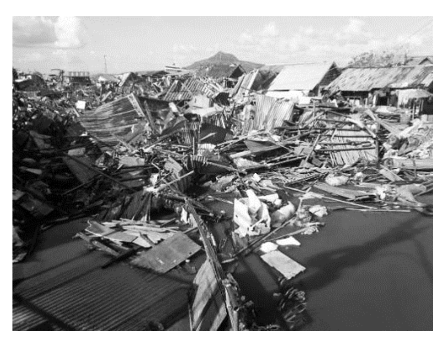
"Destroyed House"

Direction: Below is a picture of a community devastated by Super Typhoon Yolanda. Analyze the picture then list down the harms it brought to the community and tell how people can cope up from it. Use a separate sheet of paper in answering this activity.